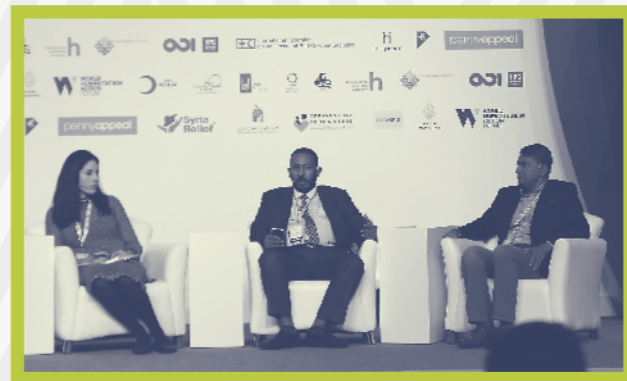
Panel: Overseas Development Institute, Islamic Development Bank, World Congress of Muslim Philanthropists

What is the scope for success for ISF? It is to ‘graduate people from poverty’ irrespective of whether they are in a humanitarian crisis or in an underdeveloped state. Islamic philanthropy