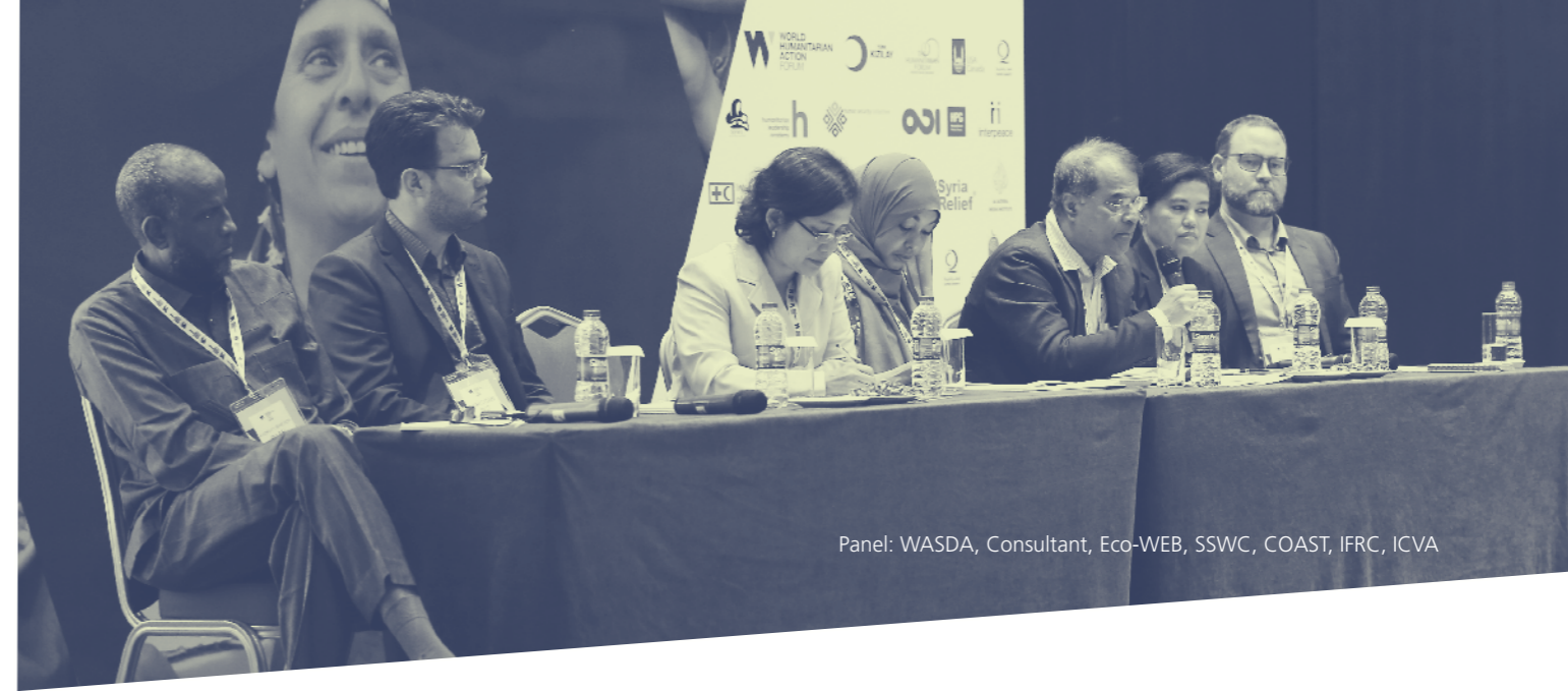
Panel: WASDA, Consultant, Eco-WEB, SSWC, COAST, IFRC, ICVA

is deeply developmental in its approach as it is humanitarian. Nexus barriers (humanitarian – development) aren’t really an issue for ISF because the foundations of Islamic giving are about creating livelihood opportunities and dignity and not just handouts. However, there are challenges for ISF. Coordination among Islamic funders and donors is a problem because there are contextual and cultural differences in how ISF is implemented. There is a need to find out if some form of coherence could be developed. WHAF or the World Congress of Muslim Philanthropists (WCMP) could provide the platforms for this exploration.