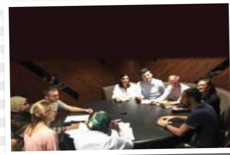
Partners Monthly Meetings 2019