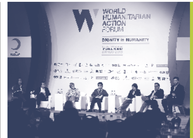
Technology panel with: Human Security Collective, World Vision, Tech Soup, START Network, Disberse

Technological solutions depend upon collaboration and co-creation. Financial instruments are changing and despite resistance from banks there is need to explore new modalities. These include 'last mile' mobile solutions for transfers and tracking through cards, mobile tech, blockchain. There are a lot of unknowns and there is need for caution. Barriers to entry for many not-for-profit organisations (NPOs) can be tackled by networks that bridge