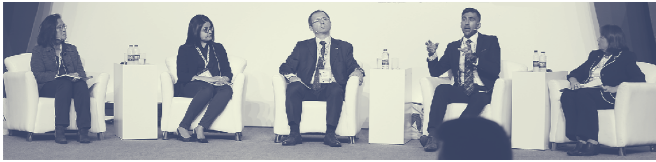
Panel: Human Security Collective, Community World Service, Turk Kizilay, Islamic Relief Worldwide, World Bank

socially responsible investing, and not humanitarian response alone. This maturity is often not taken into account by Western donors and other actors.