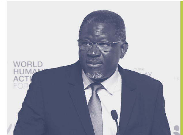
Elhadj As Sy, Secretary General of IFRC

WHAF engaged a wide spectrum of views, experiences, and commitments and partners provided many deep insights from grounded practice, careful research and compassion that they bring to their work and care for people in need.