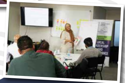
South Africa 2019