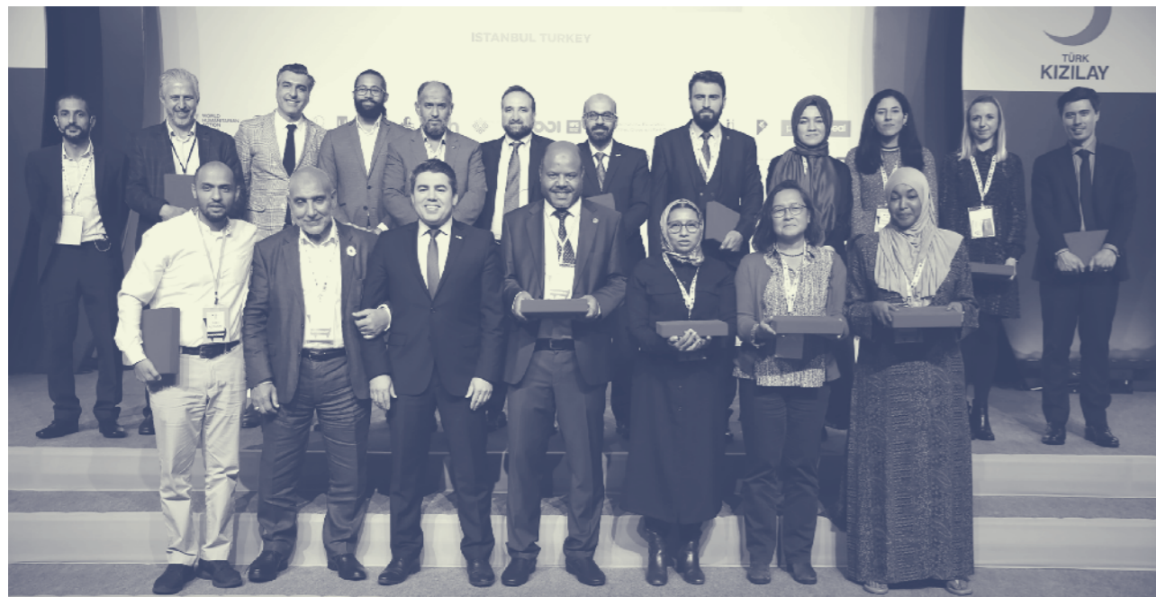
WHAF Advisory Group and Main Partners