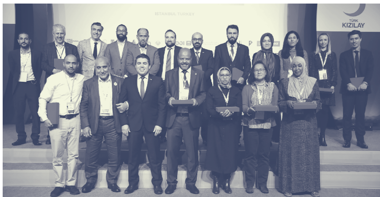
WHAF Advisory Group and Main Partners