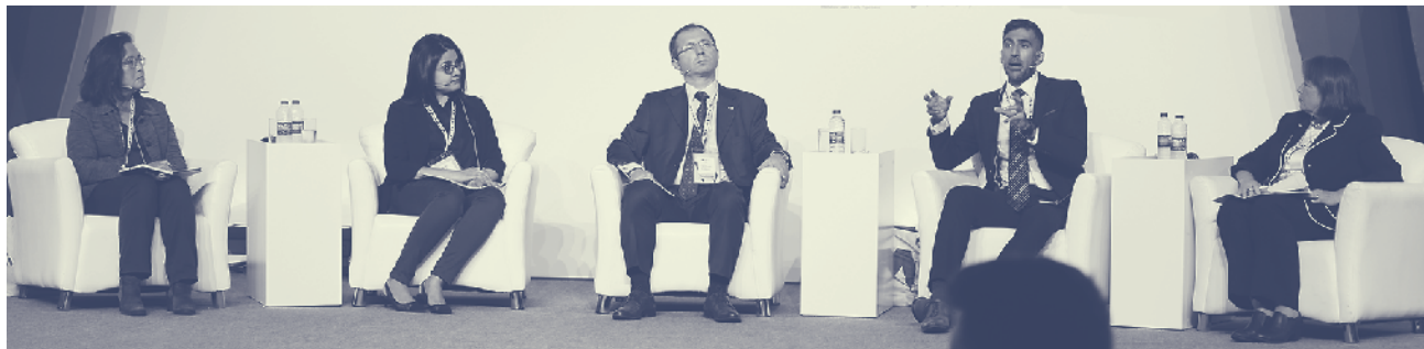
Panel: Human Security Collective, Community World Service, Turk Kizilay, Islamic Relief Worldwide, World Bank

socially responsible investing, and not humanitarian response alone. This maturity is often not taken into account by Western donors and other actors.