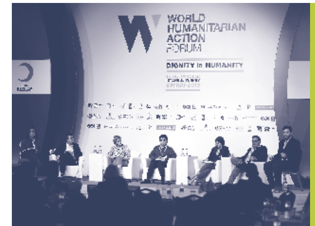
Technology panel with: Human Security Collective, World Vision, Tech Soup, START Network, Disberse

Technological solutions depend upon collaboration and co-creation. Financial instruments are changing and despite resistance from banks there is need to explore new modalities. These include 'last mile' mobile solutions for transfers and tracking through cards, mobile tech, blockchain. There are a lot of unknowns and there is need for caution. Barriers to entry for many not-for-profit organisations (NPOs) can be tackled by networks that bridge