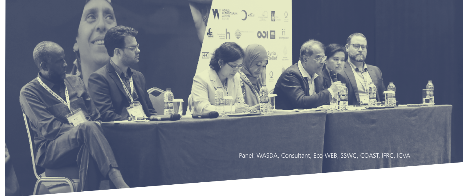
Panel: WASDA, Consultant, Eco-WEB, SSWC, COAST, IFRC, ICVA

is deeply developmental in its approach as it is humanitarian. Nexus barriers (humanitarian – development) aren’t really an issue for ISF because the foundations of Islamic giving are about creating livelihood opportunities and dignity and not just handouts. However, there are challenges for ISF. Coordination among Islamic funders and donors is a problem because there are contextual and cultural differences in how ISF is implemented. There is a need to find out if some form of coherence could be developed. WHAF or the World Congress of Muslim Philanthropists (WCMP) could provide the platforms for this exploration.