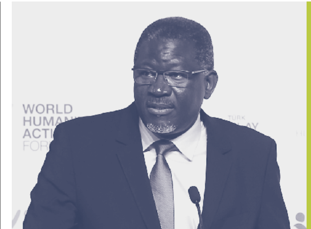
Elhadj As Sy, Secretary General of IFRC

WHAF engaged a wide spectrum of views, experiences, and commitments and partners provided many deep insights from grounded practice, careful research and compassion that they bring to their work and care for people in need.