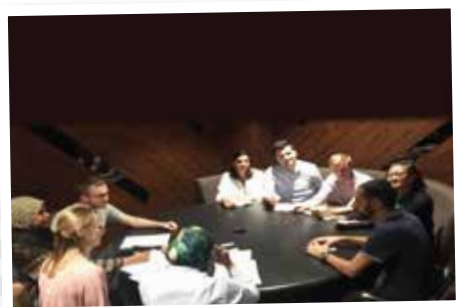
Partners Monthly Meetings 2019