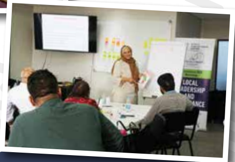
South Africa 2019